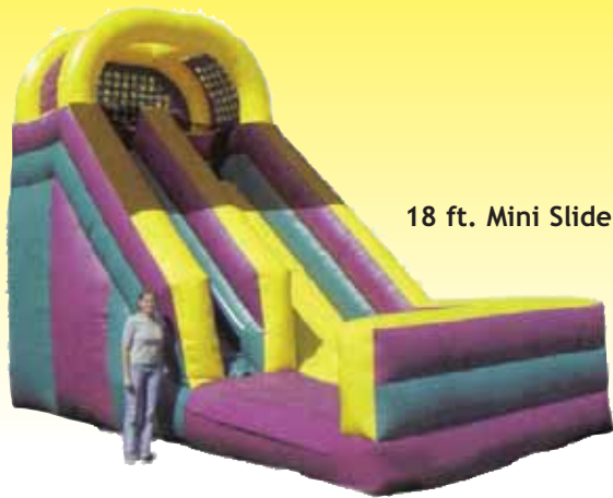
18 ft. Mini Slide