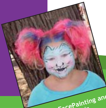
Deluxe FacePainting and Crazy Hair

“Funtastics” prices are subject to applicable sales tax and 18% surcharge, delivery fee if applicable and are subject to change.