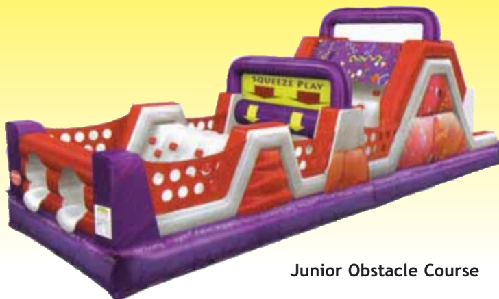
Junior Obstacle Course