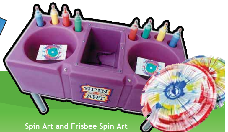
Spin Art and Frisbee Spin Art